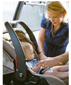
Remove baby from car first